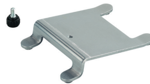
Holding device 1.837.01-7400