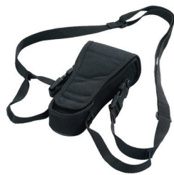
Carrying bag 1.837.01-7200