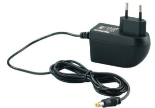
Universal power supply