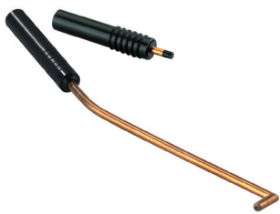
Eddy current probes