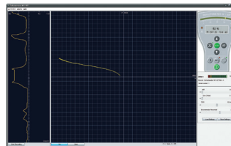
PC software 1.837.01-8200