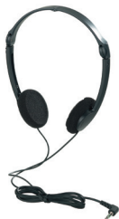
Headphones foldable 1.837.01-7400