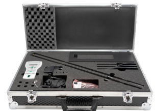
Airbus HFEC Inspection Kit 1.837.69-0038