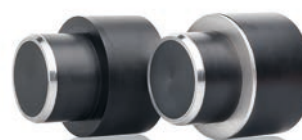
Shape adapted probes